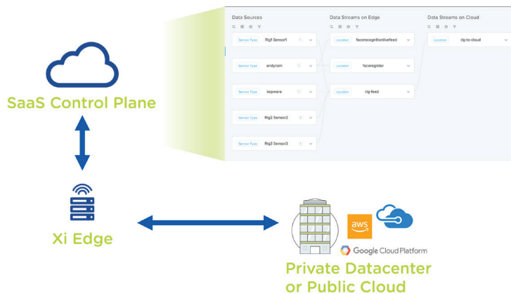
Figure: Deploy edge resources with ease

The Xi Edge platform provides secure access to IoT data sources with data pipelines all the way from the edge to the cloud. The platform allows use of public clouds including AWS, GCP, and managed/on-prem private clouds, and allows seamless data mobility between edge and cloud, to send metadata and build ML models in the cloud. Now developers can utilize edge PaaS frameworks to create building blocks to be leveraged across applications.